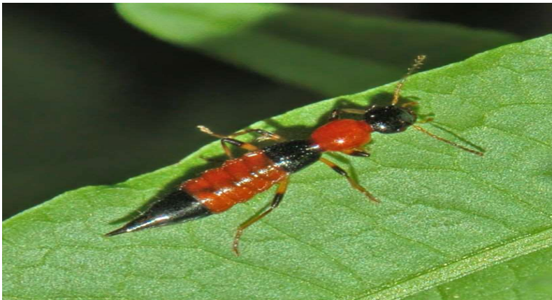
Paederus beetle (EKONDA / Cara-cara)