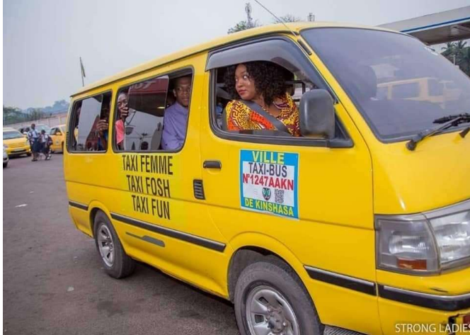
Photo of KETCH taxi and Hiace taxi-bus